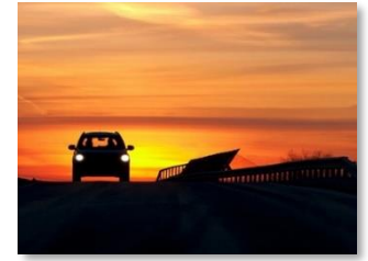
TRANSPORTATION Kristy Swan Range