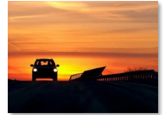
TRANSPORTATION Kristy Swan Range