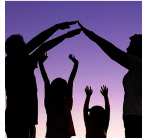
OPEN CHAIR OPEN CO-CHAIR